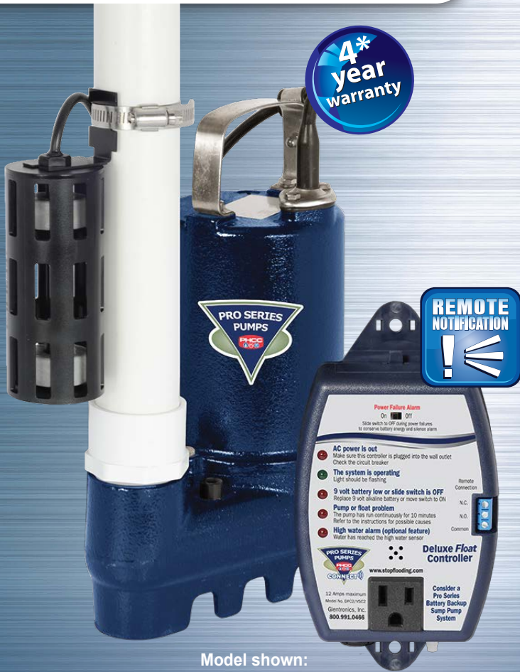
Model shown: S2033-DFC2