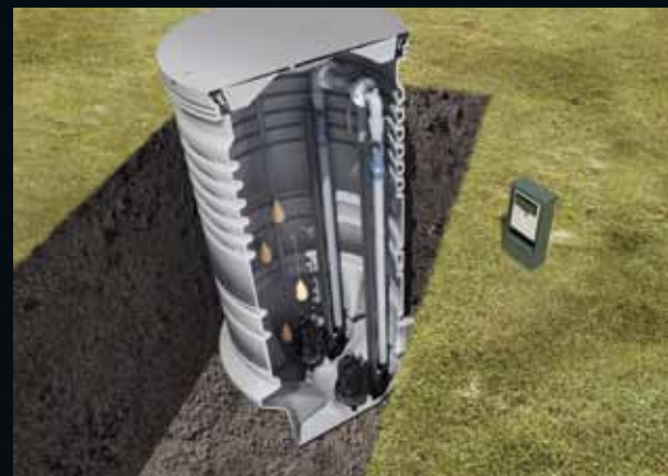
Installation options include submerged installation on auto-coupling with guide rails.