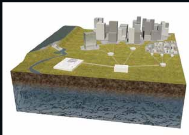
SEG pumps can be used for alternating or continuous operation throughout the water cycle. See examples online.