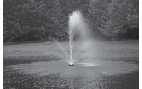
Figure 3: Water Lily - An eye-catching combination spray. Part #2A